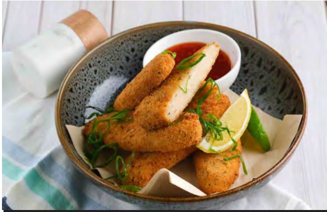
Product Code: 8115 | 5 x 1 kg | Approx. 16 pieces/bag