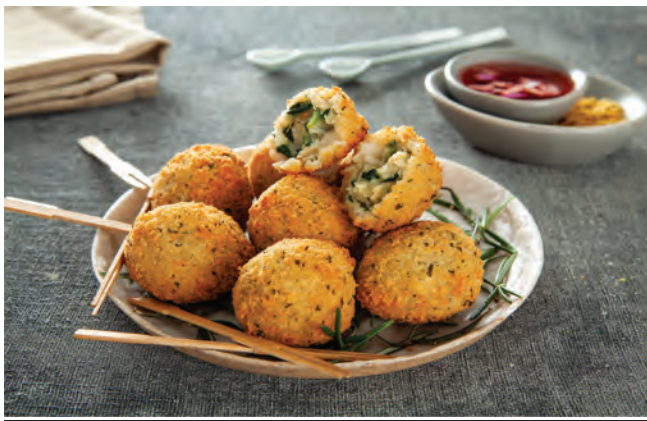
Product Code: 8124 | 5 x 1 kg | Approx. 40 pieces/bag