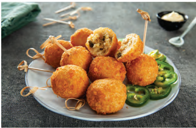
Product Code: 8123 | 5 x 1 kg | Approx. 40 pieces/bag