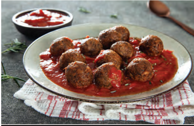
Product Code: 8122 | 5 x 1 kg | Approx. 58 pieces/bag